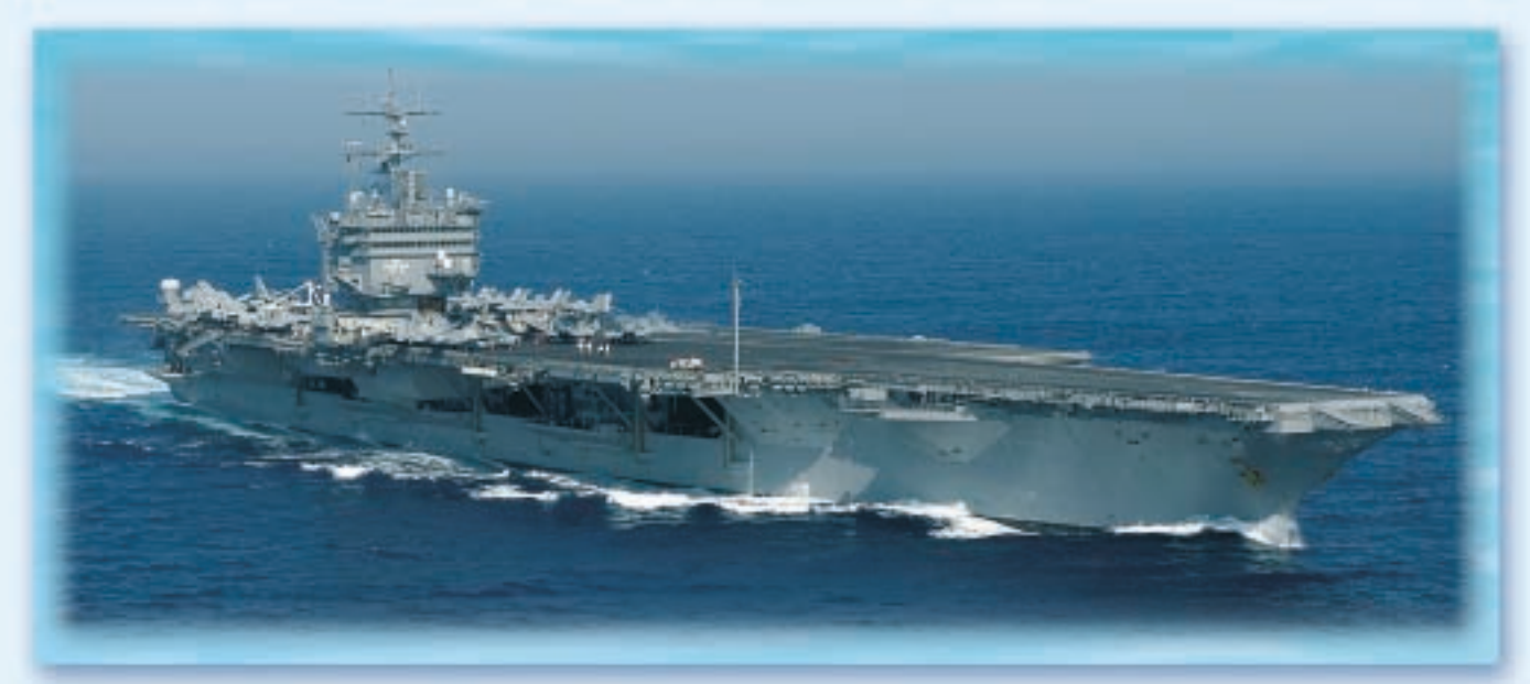
Many US Navy aircraft carriers and submarines use Hays' quiet and highly reliable Mesurflo® valves