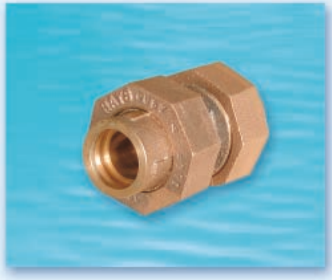
Mesurflo® Automatic Balancing Valves