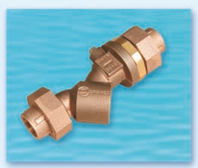
Combination Valve/Constant Flow Fitting