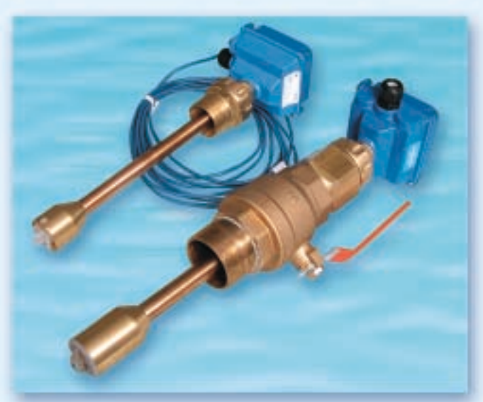
Paddle Wheel & Mag Insertion Meters