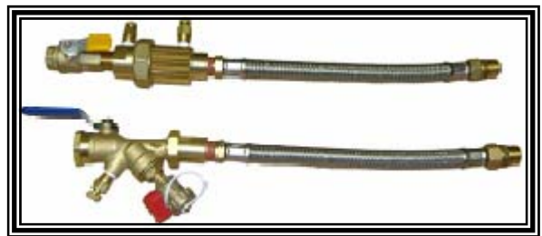
Hosekits and Piping Packages